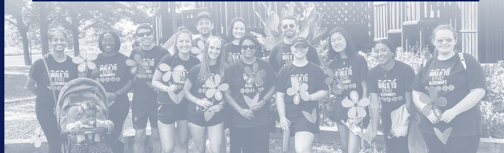
CHART also actively participated in the Walk to End Alzheimer's and organized an Illinois networking dinner at the Gerontological Society of America conference. The CHART team had a continuous presence in community events throughout the year to support recruitment for CHART-affiliated research studies and disseminate knowledge about the work of CHART.