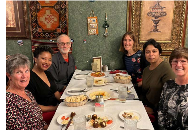
GSA networking dinner

Another major achievement was the productive meeting at the McKechnie Family LIFE Home with the Illinois Department on Aging (IDOA) leadership team in November 2022.